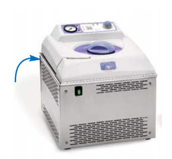
REAR PART Mains source.

Mains source. Two fuse carriers. Safety thermostat.